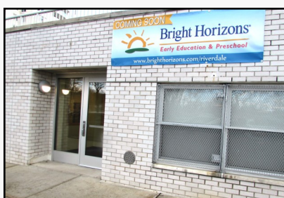
Main entrance to the center has been expanded and moved to directly front Independence Ave. The temporary "coming soon" signage will be replaced by awnings with the Bright Horizons logo to match in color the Whitehall service entrance canopy.