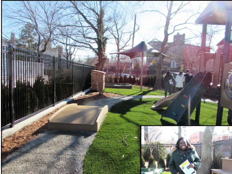
Above: Well-designed playground has a variety of structures and separate areas for different age groups. A tall fence with locked gates, fronted by trees that will grow to a substantial height, affords privacy as well as security. Right: Center Director Chandeale "M." is excited and ready to greet the first students at this new center.