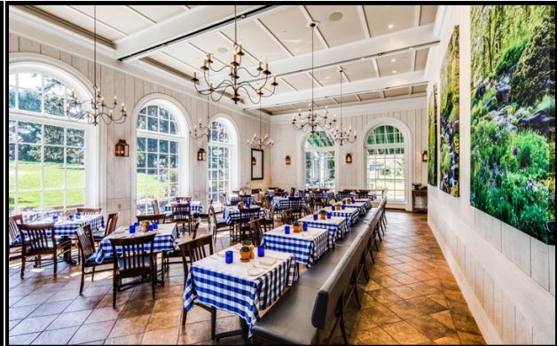
Left: When the weather cooperates, diners at the Hudson Garden Grill can enjoy their meal at an outdoor patio. Above: The main dining room has a wall of arched glass windows that overlook the grounds, with the Haupt Conservatory in the distance. Elegant chandeliers and wall murals add beauty.

❖ If you're looking for a dining experience that's relatively close at hand and offers some of the most beautiful vistas you could want, not to mention World Class cooking, then you need not look any further than our own New York Botanical Garden, and its top rated on-site restaurant, the Hudson Garden Grill.