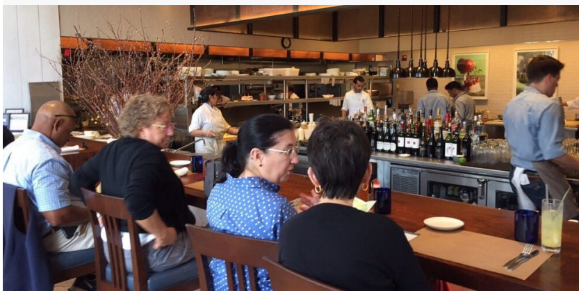
Diners can enjoy a light bite at a food counter that fronts the Grill's bustling open kitchen. The main dining room has seating for more than 100, with special party rooms also available.

One of the most innovative aspects of the Hudson Garden Grill is that it can develop complementary menus in conjunction with special exhibits at the Botanical Garden. For example, when an exhibit featuring some of the work of the celebrated Mexican artist Frida Kahlo in South of the Border-style natural settings opened in the Garden in May of 2015, the Grill tied in with an outdoor tequila bar, cantina and on-site taco