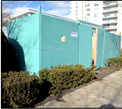
Construction enclosure along Henry Hudson Parkway sidewalk shields ongoing construction and delivery activity from passers-by and lockable gate provides an added measure of security.