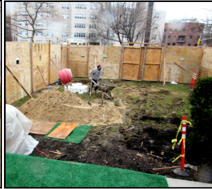
Inside the enclosure, workers can mix concrete and perform other activities off the actual green roof. Enclosure also allows for convenient truck delivery and off-loading of construction materials.