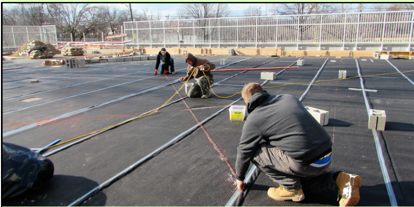
Workers take measurements for placement of electrical conduits and irrigation pipes, as the installation of drainage mats moves closer to completion. The undersides of the mats are ribbed to direct water to the several drainage pipes on the roof. Actual topsoil and planting mediums can be placed directly atop the drainage mats.