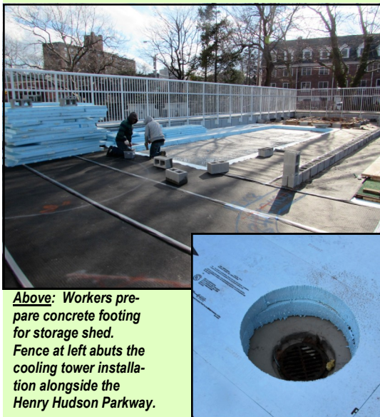
Above : Workers prepare concrete footing for storage shed. Fence at left abuts the cooling tower installation alongside the Henry Hudson Parkway.