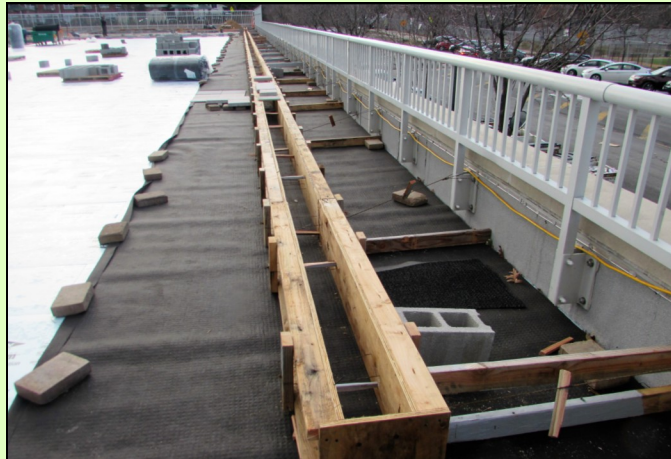
Above : Wooden form along Independence Ave. side will be filled with concrete to form curb for wall. To the right, river rock will provide a natural filler to the fence. Left : One of several drains installed in the roof clearly shows 6" depth of insulation. Porous drainage mats will completely cover the insulation. Topsoil can be heaped up directly on the drainage mats.

Whitehall's green roof. But that impression would be incorrect. There is plenty going on, as the photos on these pages, all taken at presstime in late January, will demonstrate. Whitehall General Manager Gene Staudt says that "it's nice seeing our green roof literally take shape." Mr. Staudt adds that "we are basically on schedule for an opening timed to the beginning of the summer season." He notes that "we've lost some days due to the weather, but we've been lucky so far in terms of no major winter weather delays, and in any event, we built in a cushion to account for down time due to weather delays." Gene Staudt also details progress on the installation of a lift to afford disabled and handicapped residents access to the green roof on our pool deck level, as well as new bathrooms on the pool deck level. "We've always treated this as a separate project from the green roof itself," he says, "but our architect and building management are reviewing bids received from our RFPs, and our plan has always been to have both projects completed at the same time." However, Staudt cautions, "anything can happen."