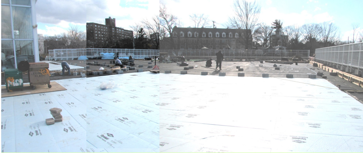
Composite photo shows the full sweep of the south end of the green roof, facing 232nd St. from Henry Hudson Parkway on the left to Independence Ave. on the right, where work is proceeding apace. At center , some construction workers are installing dark drainage mats, held in place by cinder blocks, above the 6" layer of insulation, which in turn sits atop the waterproofing membrane. At left in the composite, other workers are building wooden forms where concrete is being poured for curbs for walls and planting bed foundations.